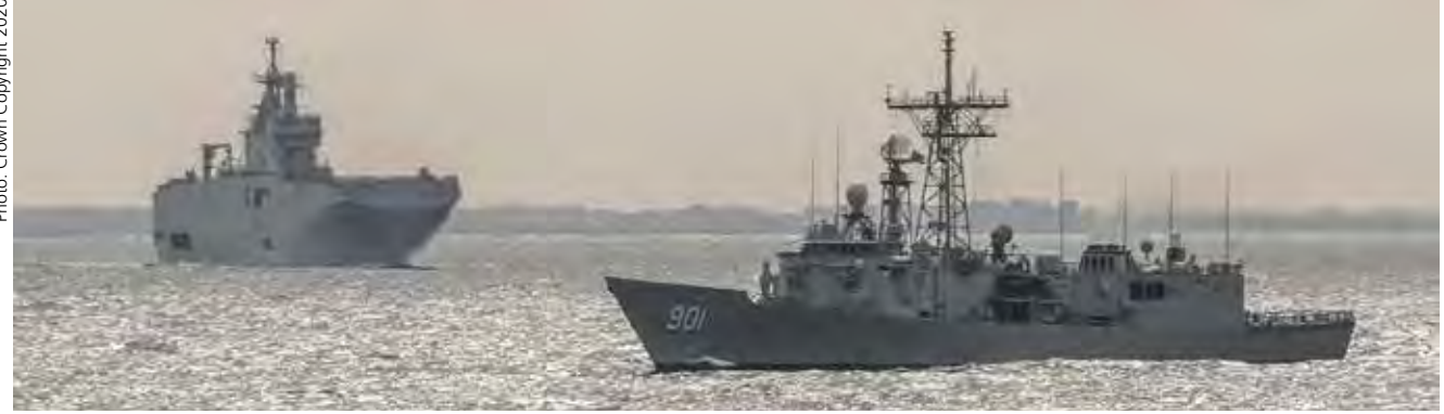
The discovery of significant energy resources in the Eastern Mediterranean has served to fuel longstanding tensions amongst countries bordering its waters.